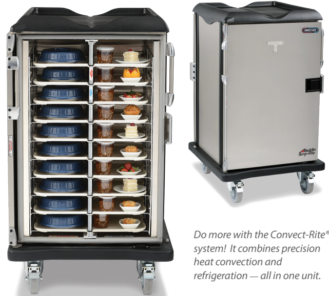
Do more with the Convect-Rite® system! It combines precision heat convection and refrigeration — all in one unit.

Need greater temperature hold-time for your cook-serve operations? Use Convect-Rite® systems for a boost! Assemble your meals via trayline on Convect-Rite® trays, load them into Convect-Rite® carts, then connect the carts to the docking station. A short BOOST cycle will improve hot and cold food temperatures prior to serving.