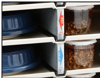
Aladdin's Auto-Therm Seal prevents temperature migration, even when no tray is present.

The center panel provides an insulating barrier that separates hot and cold foods. This enables individual meals to be gently reheated, while keeping cold items perfectly chilled.